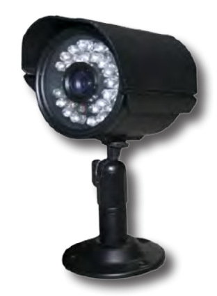
PRO-CM520 520 TVL Camera with Mounting Hardware